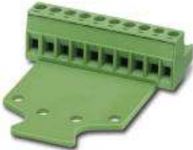
The figure shows a 10-position version of the product

Plug component, Nominal current: 12 A, Rated voltage (III/2): 320 V, Number of positions: 13, Pitch: 5.08 mm, Connection method: Screw connection, Color: green, Contact surface: Tin