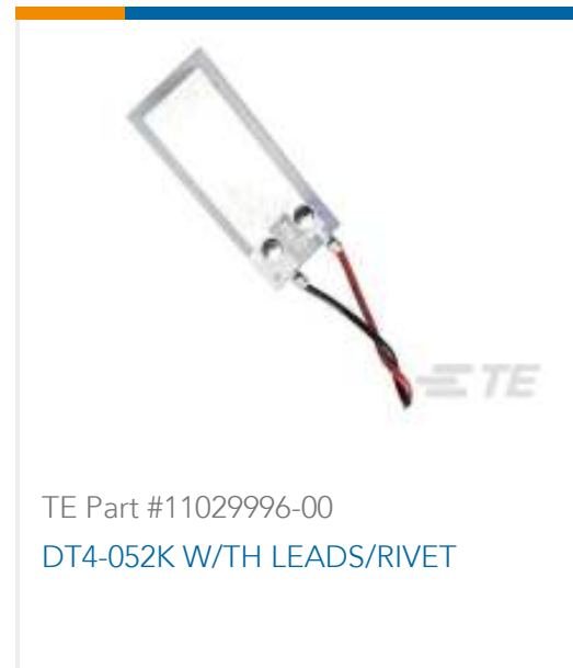
TE Part #11029996-00 DT4-052K W/TH LEADS/RIVET