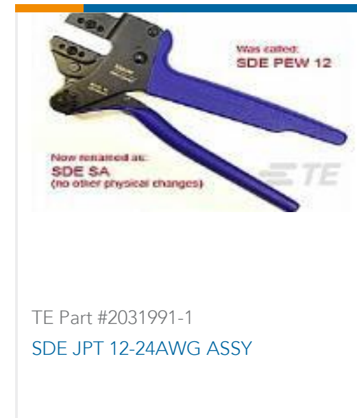
TE Part #2031991-1 SDE JPT 12-24AWG ASSY