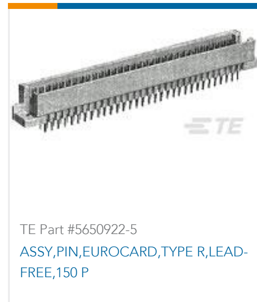
TE Part #5650922-5 ASSY, PIN, EUROCARD, TYPE R, LEAD-FREE, 150 P