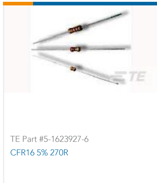
TE Part #5-1623927-6 CFR16 5% 270R