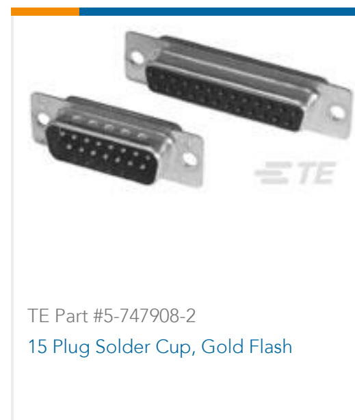
TE Part #5-747908-2 15 Plug Solder Cup, Gold Flash