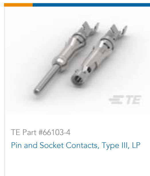
TE Part #66103-4 Pin and Socket Contacts, Type III, LP