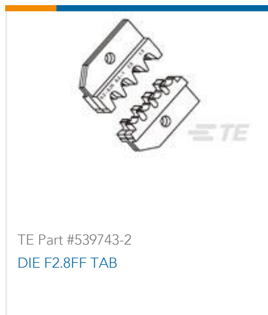
TE Part #539743-2 DIE F2.8FF TAB