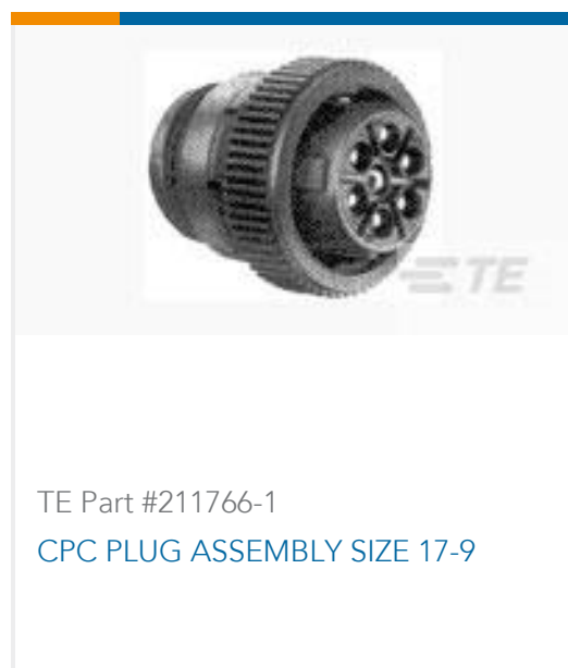
TE Part #211766-1 CPC PLUG ASSEMBLY SIZE 17-9