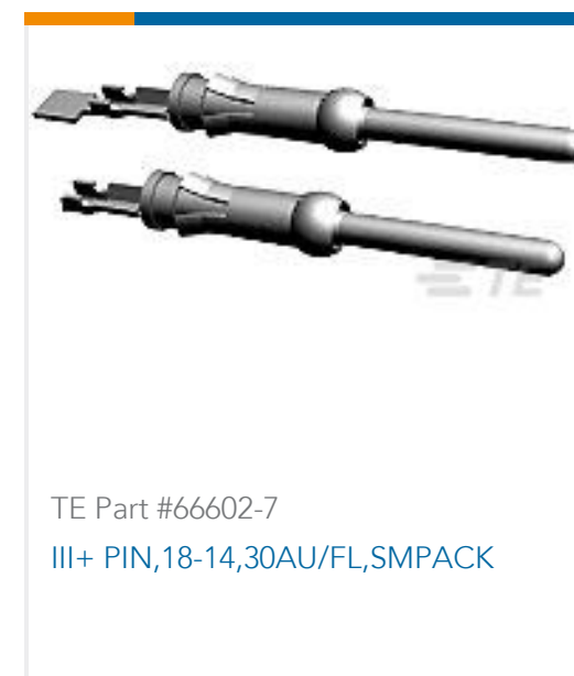
TE Part #66602-7 III+ PIN, 18-14, 30AU/FL, SMPACK