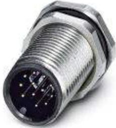
Sensor/actuator flush-type plug, 12-pos., M12, rear/screw mounting with M12 thread, with straight solder connection and key surfaces

Please be informed that the data shown in this PDF Document is generated from our Online Catalog. Please find the complete data in the user's documentation. Our General Terms of Use for Downloads are valid ( http://download.phoenixcontact.com )