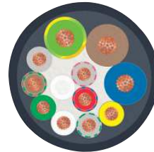
PUR/PVC black [PUR]