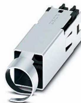
The figure shows a 2-pos. version with 4 contacts