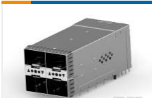
TE Part #3-2343522-3 SFP56 STACKED 2X2 RECEPTACLE ASSEMBLY