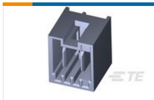
TE Part #4-1971846-2 2P, RAST 5 Tab Header, THV