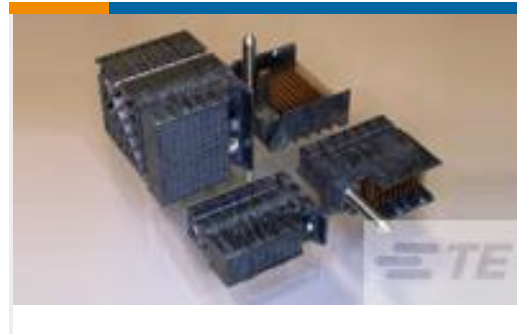
TE Part #2143012-3 IMP100S,H,RA2P10C,UG,OEW39,5.5