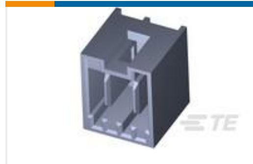
TE Part #5-1971846-2 2P, RAST 5 Tab Header, THV