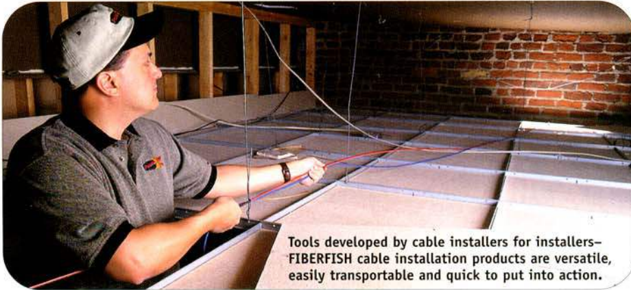
Tools developed by cable installers for installers—FIBERFISH cable installation products are versatile, easily transportable and quick to put into action.