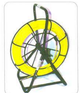
100' FiberSnake on wire reel cage 1755