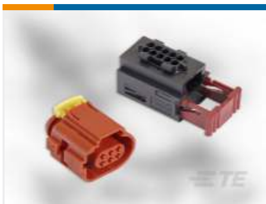
TE Part #929505-5 Timer Connector Housing