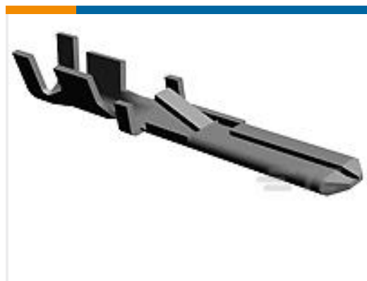
TE Part #928931-2 FF 110 (2.8 X 0.8 MM) TAB PTP CUZN30