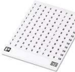
Marker cards, white, Mounting type: Adhesive, For terminal block width: 6.2 mm

Please be informed that the data shown in this PDF Document is generated from our Online Catalog. Please find the complete data in the user's documentation. Our General Terms of Use for Downloads are valid ( http://download.phoenixcontact.com )