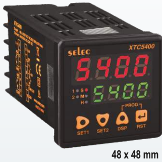
48 x 48 mm