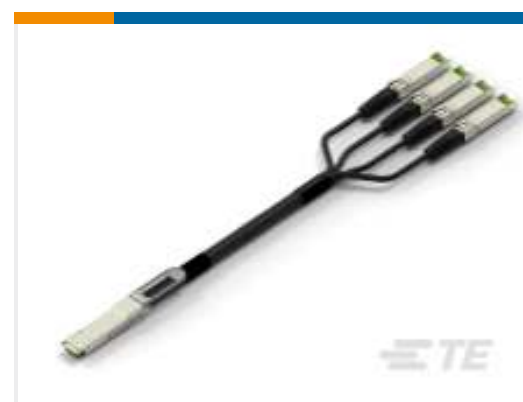
TE Part # CAT-C11-N490333 QSFP28-Four SFP+ Cable Assembly: 30 AWG