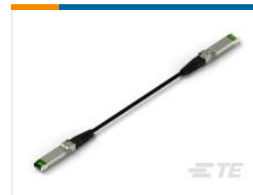
TE Part # 4-2821222-5 SFP56 DIRECT ATTACH CA, 2M, 30AWG