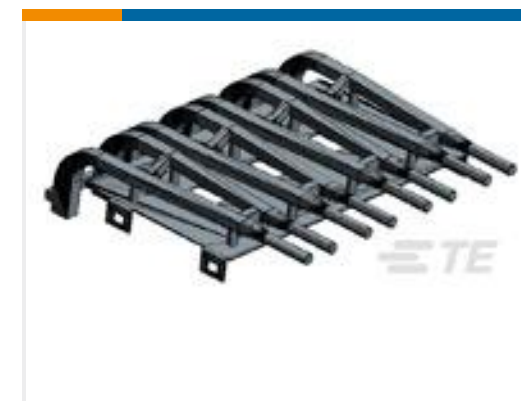
TE Part # 2170068-1 SFP+ 1x4 Light Pipe Assembly Low Profile