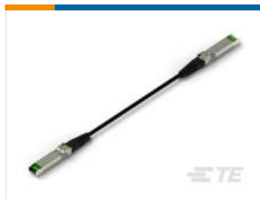
TE Part # 4-2821224-5 SFP56 DIRECT ATTACH CA, 3M, 26AWG