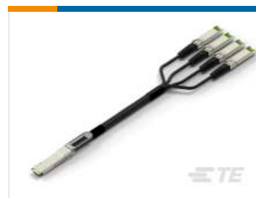
TE Part # CAT-C11-N490325 QSFP28-Four SFP+ Cable Assembly: 26 AWG