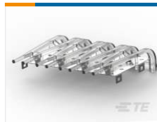
TE Part # 2007099-1 SFP+ 1x4 Light Pipe Assembly