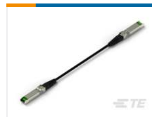
TE Part # CAT-C11-N4901114 SFP28 to SFP28 Cable Assembly: 30 AWG