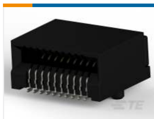
TE Part # 2110759-1 PT CONN ASSY 20 POS 16G SFP