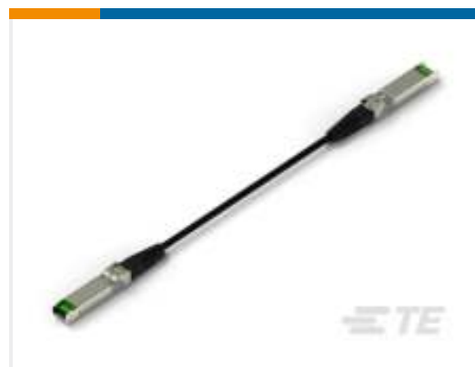
TE Part # CAT-C11-N49011 SFP28 to SFP28 Cable Assembly: 26 AWG