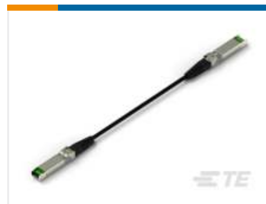
TE Part # 4-2334985-2 SFP56 DIRECT ATTACH CA, 1M, 32AWG