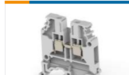
TE Part #1SNA115116R0700 M4/6