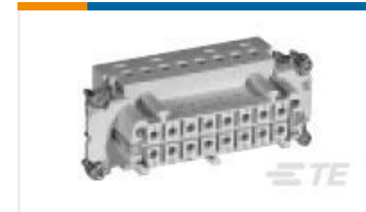
TE Part #1-1103639-1 HE.16.BU.S.B 1-16