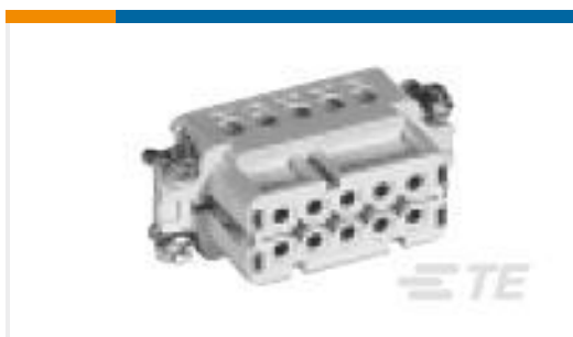
TE Part #1-1103415-1 HA.10.BU.S.B1-10