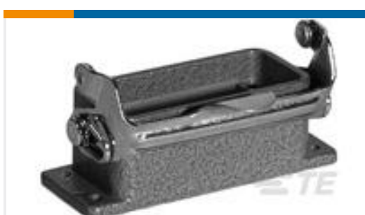
TE Part #1-1102142-2 HA.16.SG-LB.1.16