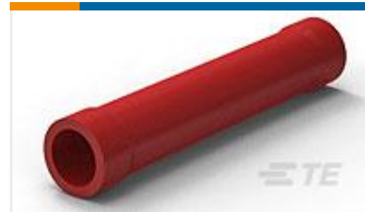
TE Part #34070 PG BUTT SPLC 22-16COMM22-18MIL