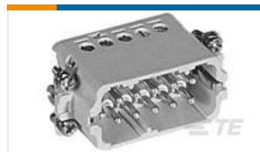
TE Part #1-1103416-1 HA.16.STI.S