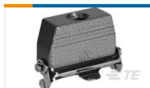
TE Part #1106437-1 HA.16.KDO-LB.1.M20G