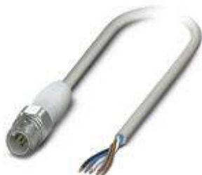
Sensor/Actuator cable, 5-position, PP-EPDM halogen-free, Gray RAL 7035, Plug straight M12, A-coded, on Free cable end, Cable length: 3 m, Hygienic design, With high-grade steel knurl

Please be informed that the data shown in this PDF Document is generated from our Online Catalog. Please find the complete data in the user's documentation. Our General Terms of Use for Downloads are valid ( http://download.phoenixcontact.com )