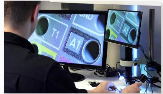
HDMI Mode (View on an HD monitor)