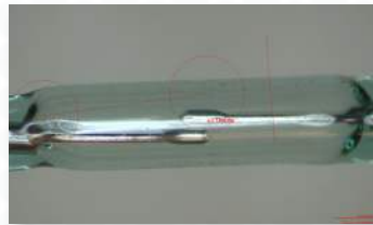
Built-in Measurement Capabilities