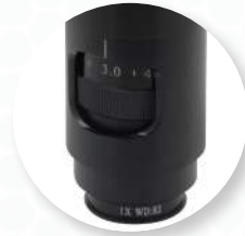
0.6x, 1x, 2x, & 4x Detents for Easy Repeatable Measurements