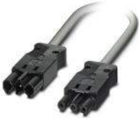
Power cable, 3-position, PVC, gray RAL 7001, Plug straight, black, on Socket straight, black, Cable length: 0.6 m

Please be informed that the data shown in this PDF Document is generated from our Online Catalog. Please find the complete data in the user's documentation. Our General Terms of Use for Downloads are valid ( http://phoenixcontact.com/download )