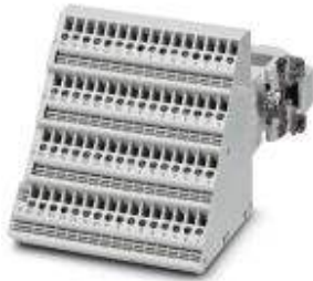
HEAVYCON terminal adapter male insert, D64 series, 64-pos., right protective conductor connection for the left side of the control cabinet, screw connection

Please be informed that the data shown in this PDF Document is generated from our Online Catalog. Please find the complete data in the user's documentation. Our General Terms of Use for Downloads are valid ( http://download.phoenixcontact.com )