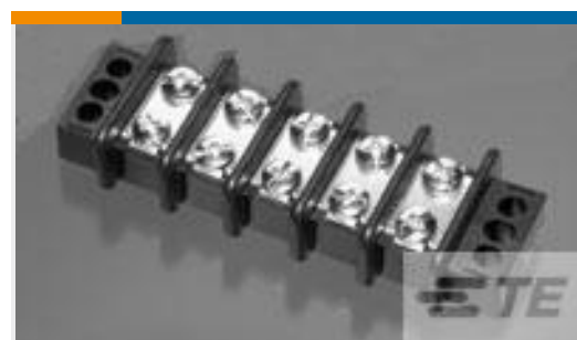
TE Part #1546310-6 6P .563" DR BARRIER STRIP