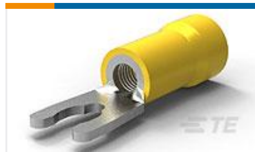
TE Part #53247-1 TERMINAL,PG SPR SPD 12-10 8