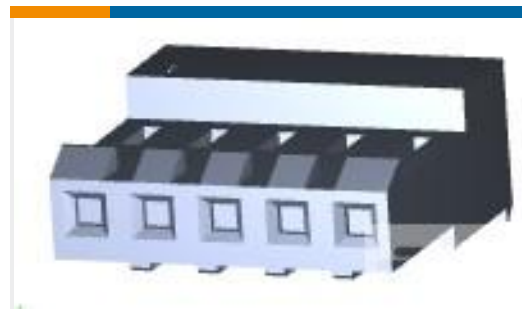
TE Part #3-640428-5 05P MTA156 CONN ASSY 22AWG RED