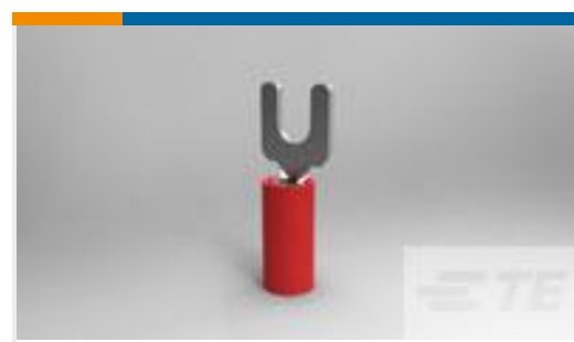
TE Part #34080 PIDG SPD 22-16 COMM 22-18MIL 6