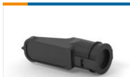
TE Part #SRK-BS-MD-90-001 BKSHL, MED, BLK, RA, NW 17/22