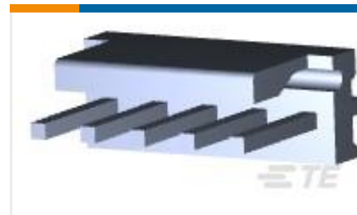
TE Part #640445-5 05P MTA156 HDR ASSY FL/STR SN