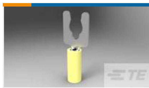
TE Part #52941 TERMINAL,PIDG SPR SPD 12-10 6