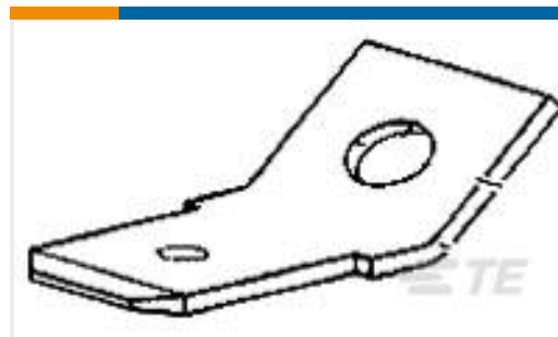
TE Part #60465-1 250 FASTON TAB BR