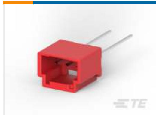
TE Part #3-2232546-3 GI2.5 HDR ASS 3P RED NO BOSS TAPE