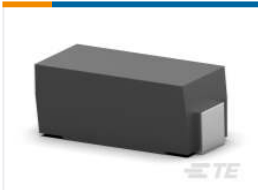
TE Part #8-2176459-5 SMW 7W 330R 5% Taped