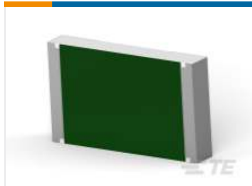
TE Part #3-2176401-4 3540 330K 1%