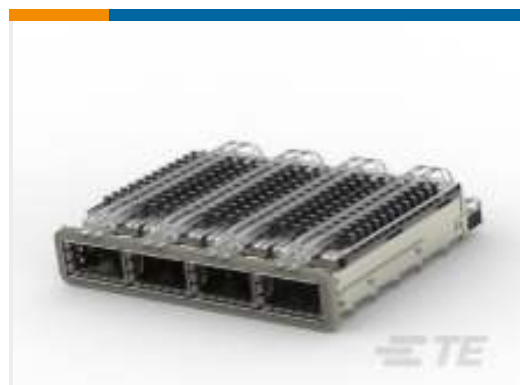
TE Part #2-2170785-2 CAGE ASSY, 1X4, QSFP28, GASKET, HS, LP