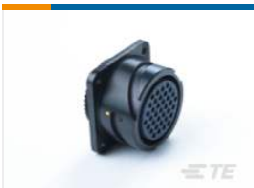
TE Part #Y5015-000000100138 FIXED SOCKET CONNECTOR