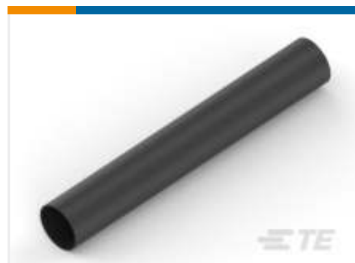
TE Part #5223654002 CGPE-105-1/2-X-SP