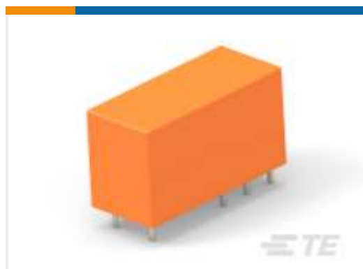
TE Part #2-1649328-8 RT334005