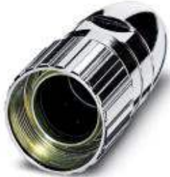
Sleeve housing for cable connector, straight, Screw locking, M23, Shielded: No, Cable cross section: 6 mm...10 mm

Please be informed that the data shown in this PDF Document is generated from our Online Catalog. Please find the complete data in the user's documentation. Our General Terms of Use for Downloads are valid ( http://download.phoenixcontact.com )