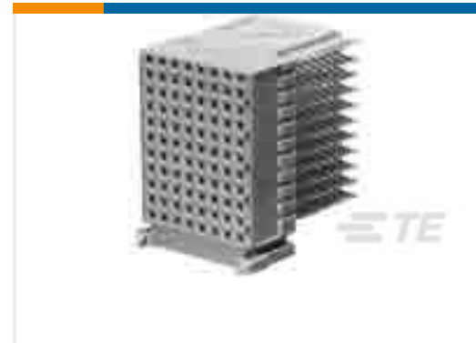
TE Part #5646446-1 2MM HM,ASY,T-F,REC,TWIST TULIP