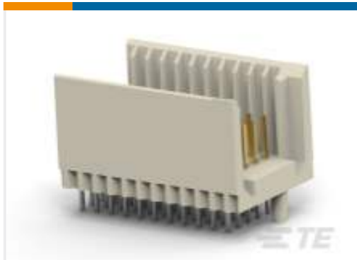
TE Part #5646356-1 Hard Metric Male Connector: Traditional Backplane, Mezzanine, 2mm