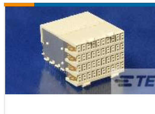
TE Part #2065657-1 zd Plus, 4 pair, receptacle assy