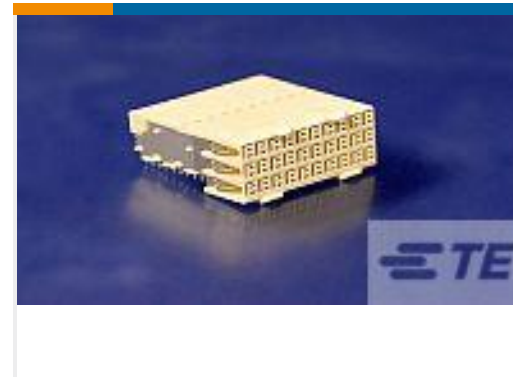
TE Part #2065883-1 Zd Plus, 3 pair receptacle ass