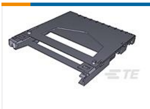
TE Part #1939115-1 SD CONN STD EMBOSS W/B REVERSE