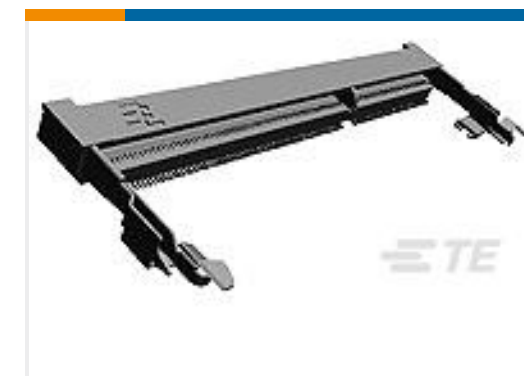
TE Part #2-2013287-1 EMBOSS TAPE DDR3 204P 4H RVS