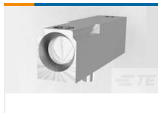
TE Part #5223957-3 UPM GUIDE MODULE