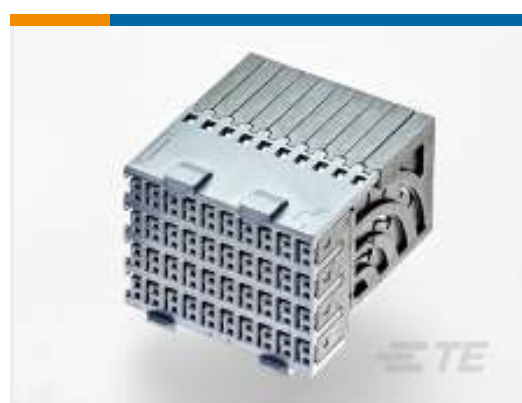
TE Part # 2170903-1 RECEPTACLE HM-EZD+, 4PAIRS 10COLUMNS