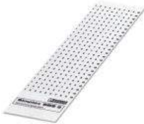
The illustration shows a version of the product

Please be informed that the data shown in this PDF Document is generated from our Online Catalog. Please find the complete data in the user's documentation. Our General Terms of Use for Downloads are valid ( http://download.phoenixcontact.com )