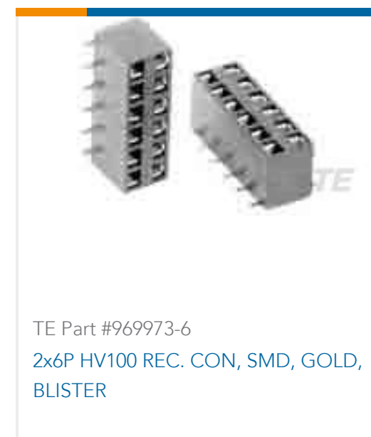
TE Part #969973-6 2x6P HV100 REC. CON, SMD, GOLD, BLISTER