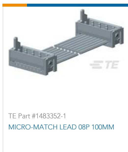
TE Part #1483352-1 MICRO-MATCH LEAD 08P 100MM