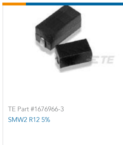
TE Part #1676966-3 SMW2 R12 5%