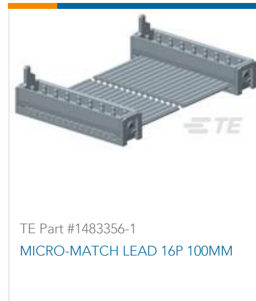
TE Part #1483356-1 MICRO-MATCH LEAD 16P 100MM