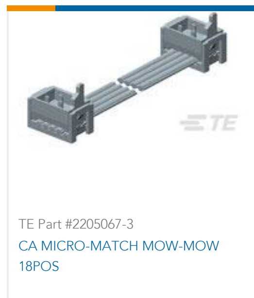
TE Part #2205067-3 CA MICRO-MATCH MOW-MOW 18POS