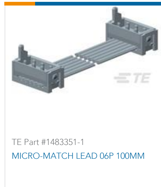
TE Part #1483351-1 MICRO-MATCH LEAD 06P 100MM