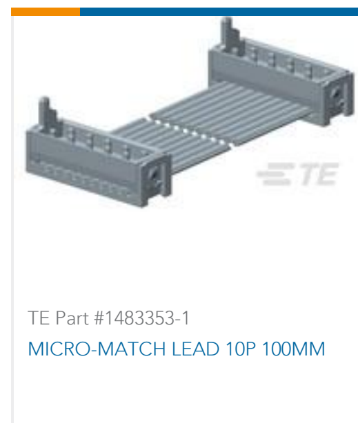
TE Part #1483353-1 MICRO-MATCH LEAD 10P 100MM