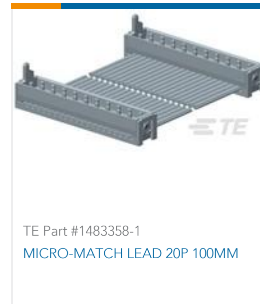
TE Part #1483358-1 MICRO-MATCH LEAD 20P 100MM