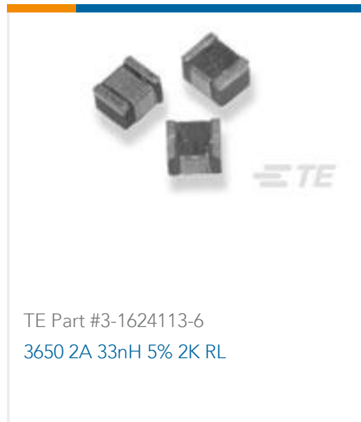
TE Part #3-1624113-6 3650 2A 33nH 5% 2K RL