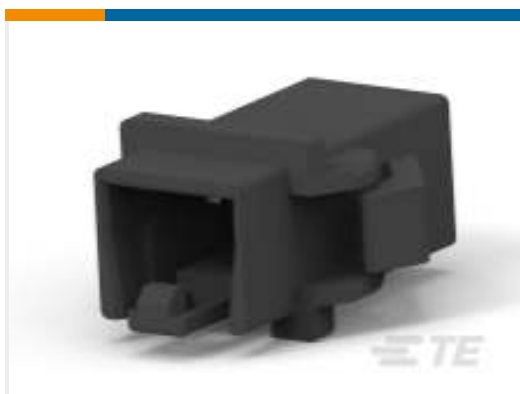
TE Part #2-292215-2 MINI CT SGL RELAY 2P BLACK