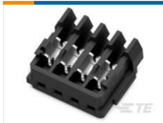
TE Part #2-353293-4 1.5MM CT MT REC ASS'Y 4P BLACK