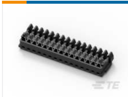
TE Part #3-353293-5 1.5MM CT MT REC ASSY 15P BLACK