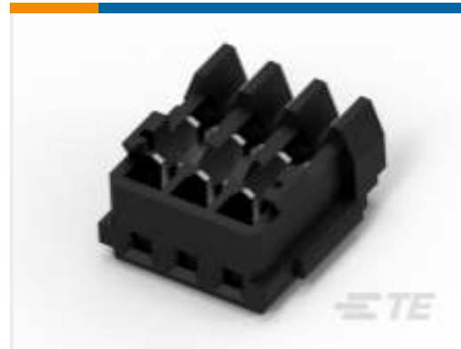
TE Part #2-353293-3 1.5MM CT MT REC ASS'Y 3P BLACK