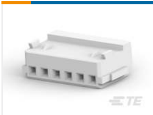
TE Part #1612257-7 MINI CT DRAWER RECEPTACLE HOUSINGS