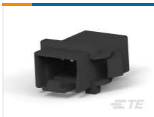
TE Part #2-292215-3 MINI CT SGL RELAY 3P BLACK