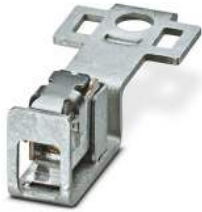
PE adapter with PT connection, for 1 PE connection, for HC-B / HC-BB / HC-DD / HC-D40 / HC-D64 contact inserts

Please be informed that the data shown in this PDF document is generated from our online catalog. Please find the complete data in the user documentation. Our general terms of use for downloads are valid.