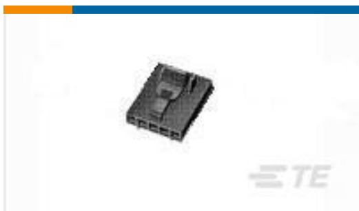
TE Part #104257-2 03 MTE RCPT HSG SR LATCH .100