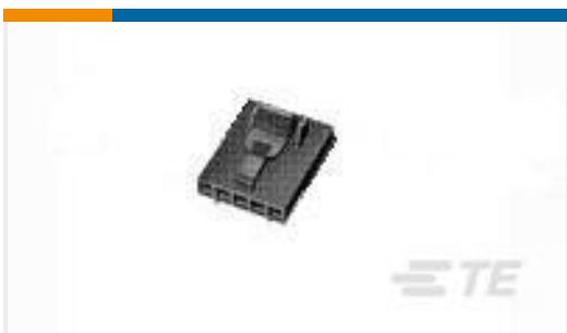
TE Part #104257-5 06 MTE RCPT HSG SR LATCH .100