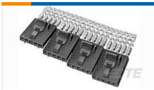
TE Part # 103956-7 2X8 MTE RCPT SR LATCH .100CL