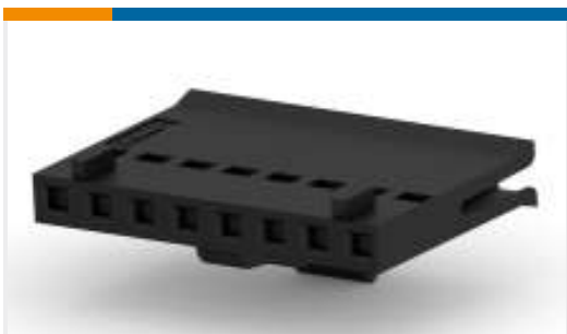
TE Part # 487526-7 008 HOUSING FFC RCPT 100CL SR