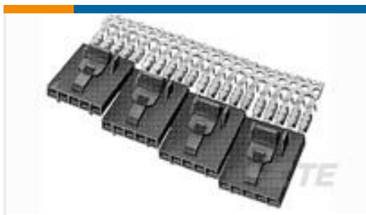
TE Part # 103959-7 2X8 MTE RCPT SR LATCH .100CL