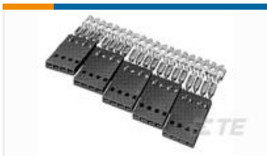
TE Part # 103968-7 2X8 MTE RCPT SR RIBBED .100CL