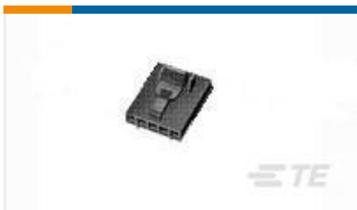
TE Part #104257-7 08 MTE RCPT HSG SR LATCH .100