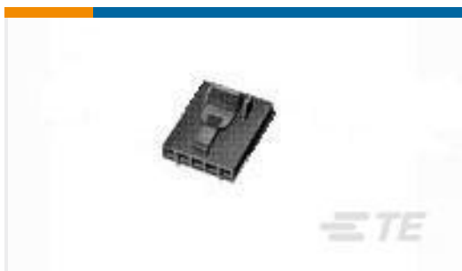
TE Part #104257-3 04 MTE RCPT HSG SR LATCH .100