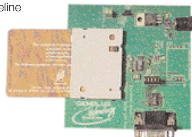
AT83C21GC Reference Design