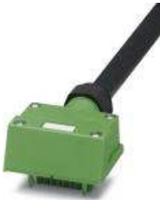
Sensor/actuator connector hood, with master cable, marking label, for an SAC box with 4 single-occupied slots

Please be informed that the data shown in this PDF Document is generated from our Online Catalog. Please find the complete data in the user's documentation. Our General Terms of Use for Downloads are valid ( http://download.phoenixcontact.com )