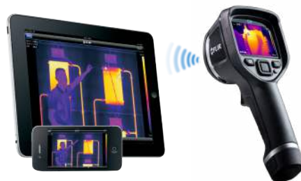
Wireless connectivity to smartphones, tablets and more.

PORTLAND Corporate Headquarters FLIR Systems, Inc. 27700 SW Parkway Ave. Wilsonville, OR 97070 PH: +1 866.477.3687