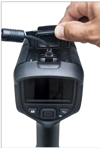
Download images fast via USB.

Specifications are subject to change without notice. For the most up-to-date specifications, go to www.flir.com