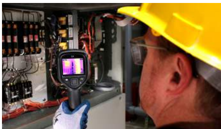
Variable emissivity and reflected temperature parameters give you reliable results fast