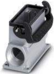
HEAVYCON box mounting base B16, with single locking latch, height 67 mm, with supports 2xM25

Please be informed that the data shown in this PDF Document is generated from our Online Catalog. Please find the complete data in the user's documentation. Our General Terms of Use for Downloads are valid ( http://download.phoenixcontact.com )