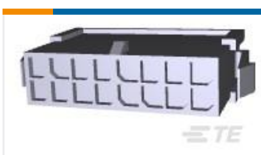
TE Part #1-794615-6 PANEL MT DBL ROW HSG 16 POS