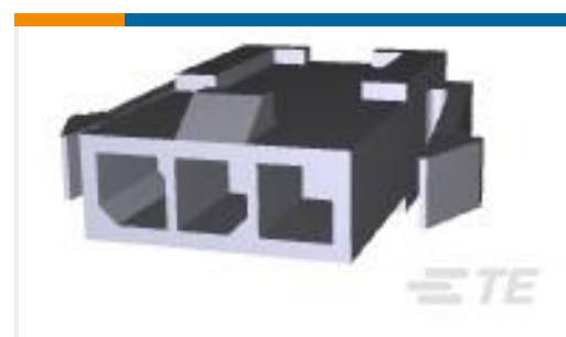
TE Part #1445048-3 PANEL MT SNGL ROW HSG 3 POS