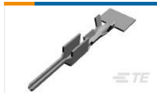
TE Part #1-794609-1 PIN CONT 26-30 15 GOLD STRIP