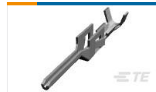
TE Part #1-794613-0 PIN CONT 26-30 TIN PLATE L/P