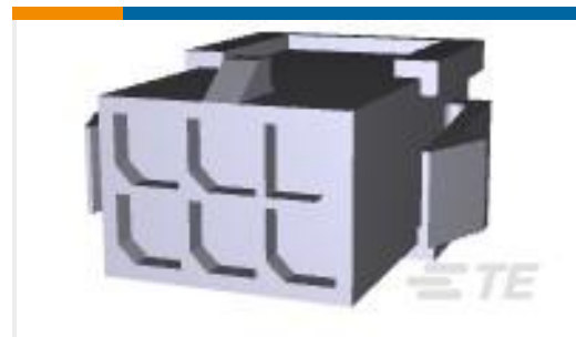
TE Part #794615-6 PANEL MT DBL ROW HSG 6 POS