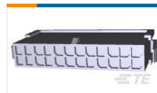
TE Part #2-794615-4 PANEL MT DBL ROW HSG 24 POS