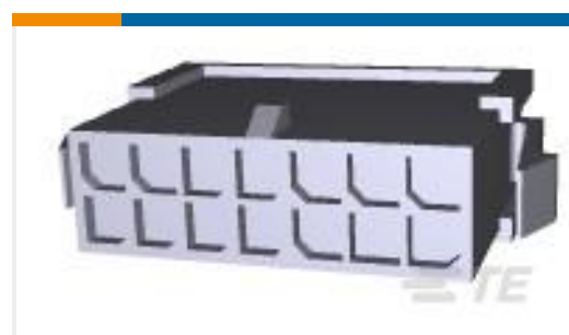
TE Part #1-794615-4 PANEL MT DBL ROW HSG 14 POS