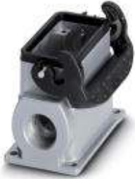
HEAVYCON box mounting base B10, with single locking latch, height 74 mm, with supports 1xM32

Please be informed that the data shown in this PDF Document is generated from our Online Catalog. Please find the complete data in the user's documentation. Our General Terms of Use for Downloads are valid ( http://phoenixcontact.com/download )