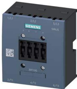
Arc chute for 3RT1456