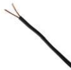
FIGURE 8 SPEAKER CABLE - 100M REEL

Roll of flexible, standard black speaker cable. 2 x (7x0.18mm).