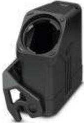
HEAVYCON EVO coupling housing, plastic, with bayonet flange for EVO screw connection, D25, with single locking latch, without EVO screw connection

Please be informed that the data shown in this PDF Document is generated from our Online Catalog. Please find the complete data in the user's documentation. Our General Terms of Use for Downloads are valid ( http://phoenixcontact.com/download )