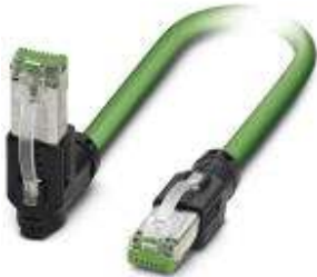
EtherCAT patch cable, shielded, star quad, AWG 22 stranded (7-wire), green, RJ45 connector/IP20, straight, to RJ45 connector/IP20, angled, length: 2.0 m

Please be informed that the data shown in this PDF Document is generated from our Online Catalog. Please find the complete data in the user's documentation. Our General Terms of Use for Downloads are valid ( http://download.phoenixcontact.com )