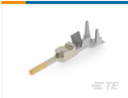
TE Part # 1-2834068-3 PIN CONTACT, MINIATURE WATERPROOF CONN