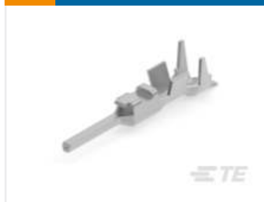
TE Part # 2-2834068-2 PIN CONTACT, MINIATURE WATERPROOF CONN