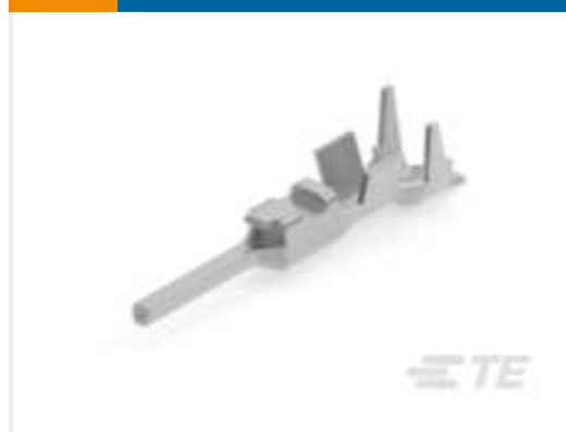
TE Part # 1-2834068-2 PIN CONTACT, MINIATURE WATERPROOF CONN