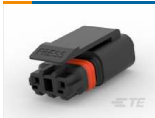
TE Part #3-2834074-3 SlimSeal Miniature Plugs