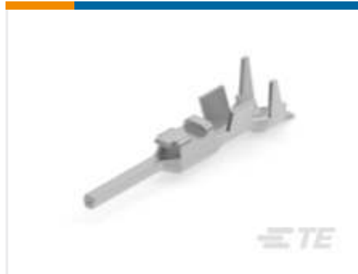
TE Part #2-2834068-2 PIN CONTACT, MINIATURE WATERPROOF CONN