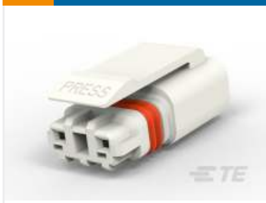
TE Part # 1-2834074-2 2P PLUG, MINIATURE WATERPROOF CONN. WHITE