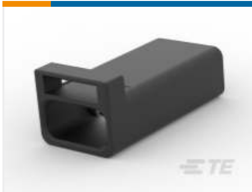
TE Part #1-2834075-3 SlimSeal Miniature Receptacles