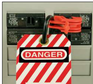
“No Tool” Circuit Breaker Lockout Device