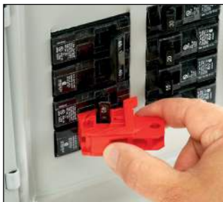
PowerLOK™ Circuit Breaker Lockout Device