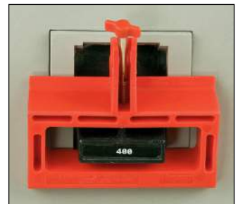
Large Handle Circuit Breaker Lockout Device