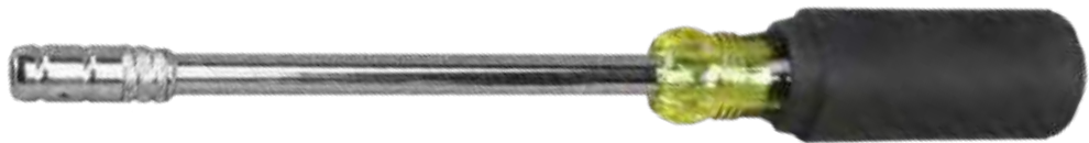
Extended Reach 65129 1/4" 5/16"