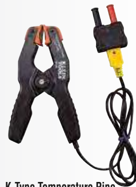
K-Type Temperature Pipe Clamp with Adapter 69140

Thermocouples are NOT intended for use on people or animals.