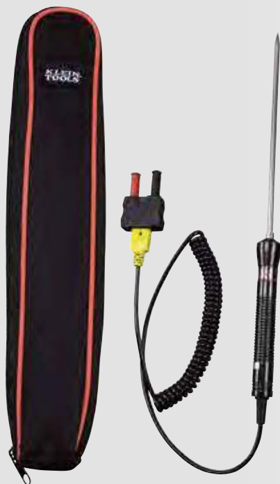
K-Type Temperature Probe with Adapter and Case 69144