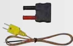
K-Type High Temperature Thermocoupler with Adapter 69142