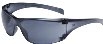
3M™ Virtua™ AP

Graceful unisex styling and integral sideshields.