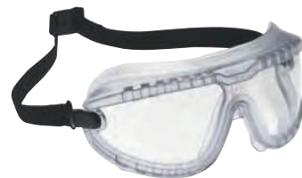
3M™ Lexa™ Splash GoggleGear™

Lightweight, low-profile splash goggle with adjustable lens angle.