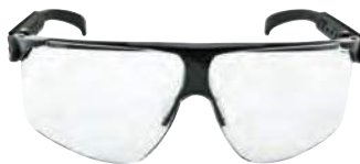
3M™ Maxim™ w/RAS

RAS (rugged anti-scratch coating) – for tough environments that require extremely scratch-resistant lenses.