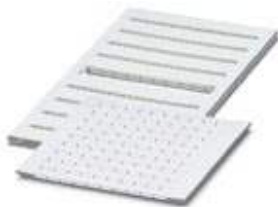
Flat zack marker sheet, white, For terminal block width: 6.2 mm

Please be informed that the data shown in this PDF Document is generated from our Online Catalog. Please find the complete data in the user's documentation. Our General Terms of Use for Downloads are valid ( http://download.phoenixcontact.com )