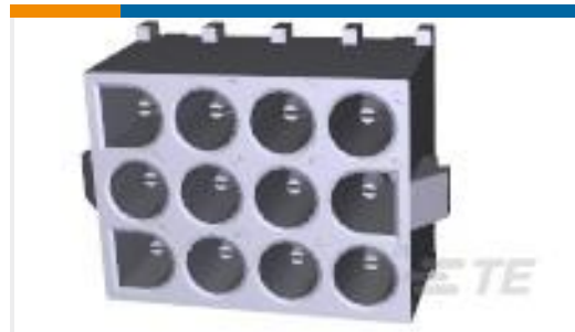
TE Part #350737-1 12P UMNL PIN HDR ASSY 94VO