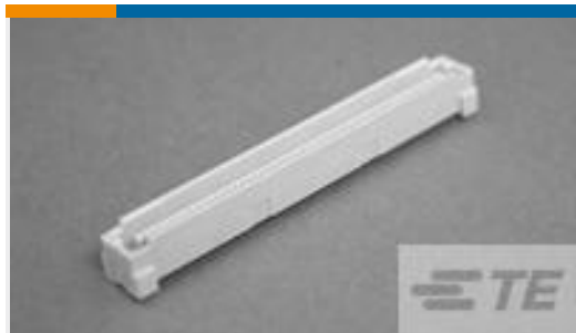
TE Part #6-5177986-4 0.8FH,P06H.5,100,30/Sn,TR,SC