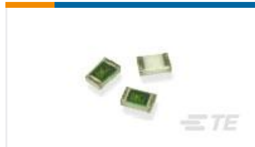
TE Part #2-2176093-8 RP 2A 0.25W 18K2 0.1% 25PPM 1K RL