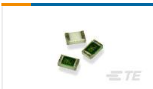
TE Part #9-1879338-0 CPF 0603 226K 1% 50PPM 1K RL