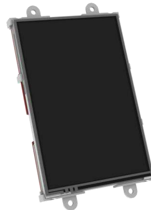
The uLCD-35DT Display Module