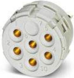
Contact insert, Number of positions: 8+1, Type of contact: Socket, Solder connection

Please be informed that the data shown in this PDF Document is generated from our Online Catalog. Please find the complete data in the user's documentation. Our General Terms of Use for Downloads are valid ( http://phoenixcontact.com/download )