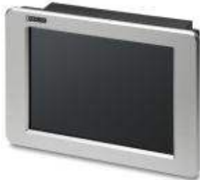
15-in. display shown

Please be informed that the data shown in this PDF Document is generated from our Online Catalog. Please find the complete data in the user's documentation. Our General Terms of Use for Downloads are valid ( http://download.phoenixcontact.com )