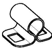
Foil Clip Folienklammer