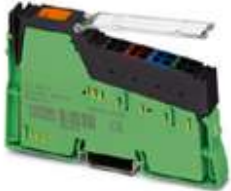
Inline coupling module, complete with accessories (connector and marking label)

Please be informed that the data shown in this PDF Document is generated from our Online Catalog. Please find the complete data in the user's documentation. Our General Terms of Use for Downloads are valid ( http://phoenixcontact.com/download )