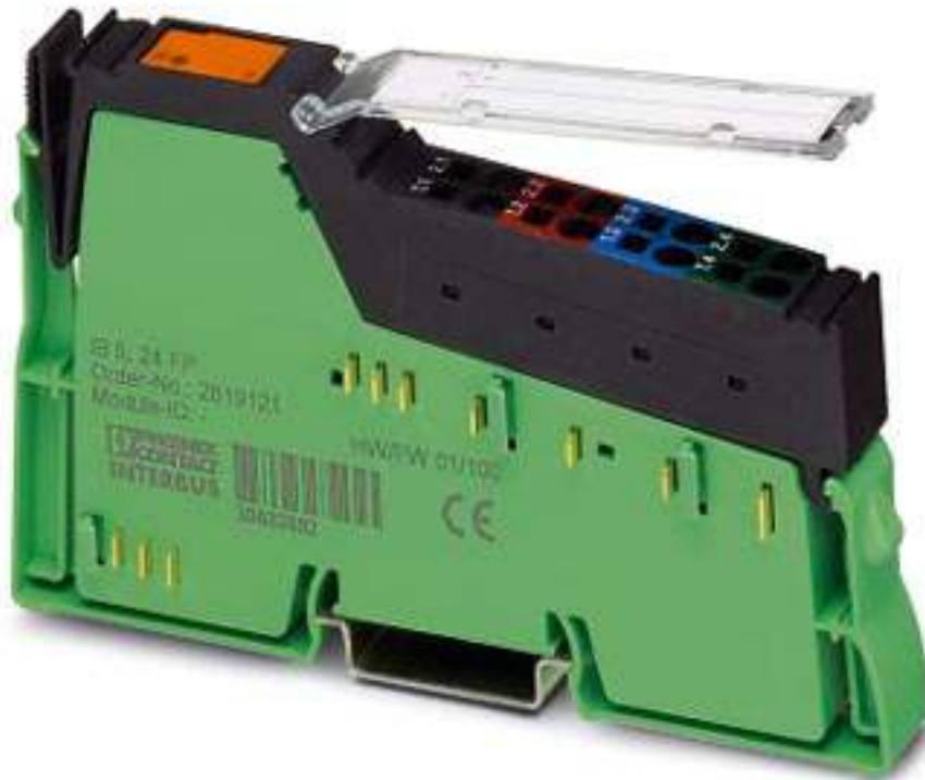
Figure may contain other products.