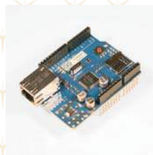
Arduino ETH Shield Rev3 WITHOUT PoE Module