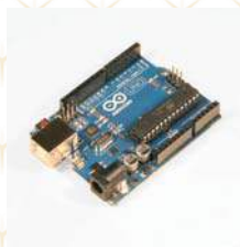
Arduino Uno Rev3