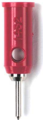
Model 1432 Banana Jack to Pin Tip Plug