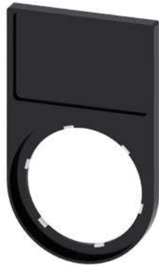
Label holder, 22mm, flat, Frame rounded off at the bottom black, for labeling plate 17.5 mm x 27 mm, for gluing