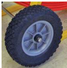
All Terrain Wheel